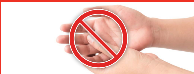
POTENTIAL REPETITIVE STRAIN INJURIES (RSI)