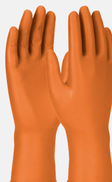
PIP® Grippaz® Engage sized S - 3XL