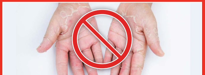
RISK OF SKIN INFECTIONS FROM REPEATED USE