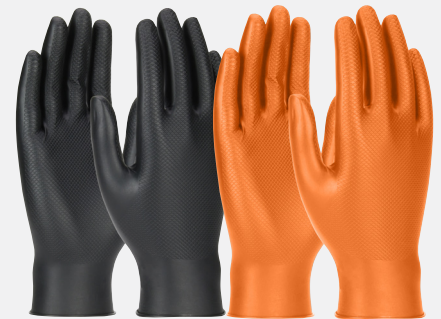
PIP® Grippaz® Skins 67-246 (Black) // 67-256 (Orange) sized S - 2XL