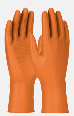
PIP Grippaz Engage sized S - 3XL

% of Savings by Switching to Extended Use Over Disposable: